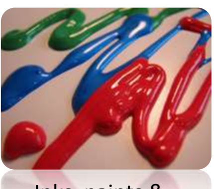
Inks, paints &

E.g. Collaboration Applisurf: UGent, BBEPP,... & Industrial partners in field of 'Bio-surfactants'