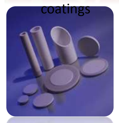
Alloys & ceramic materials