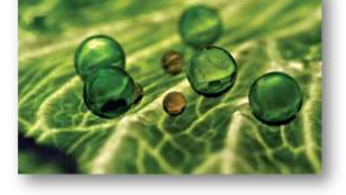
Micro – capsules