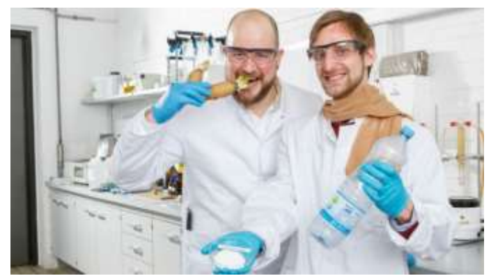
"Nylon from Chicory"