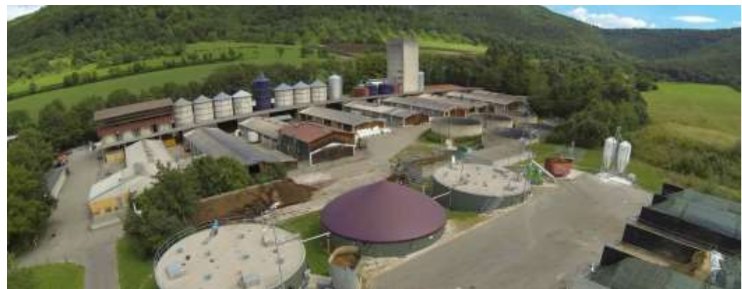
Research station "Unterer Lindenhof" location of Biorefinery Technikum